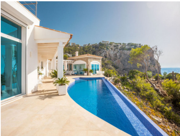
Infinity pool with sea views