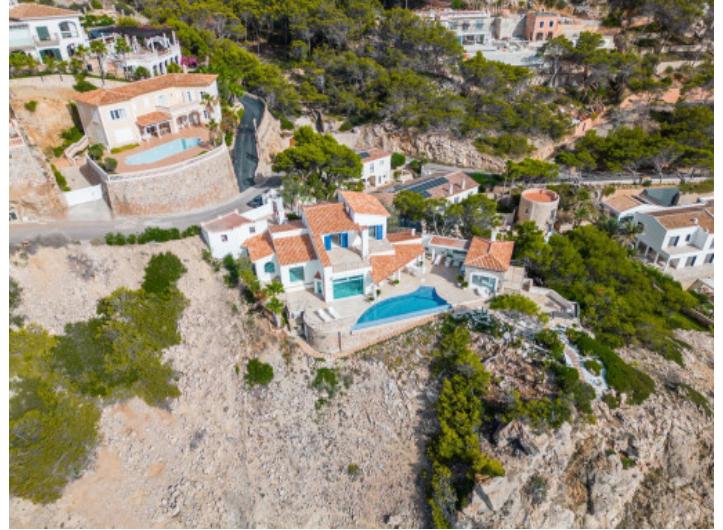
View from above