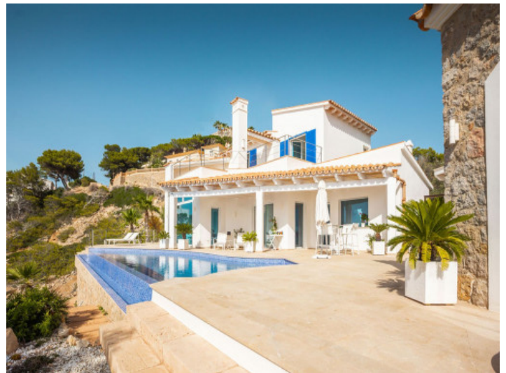
Sunny pool area