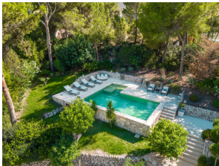
Pool oasis in a green garden