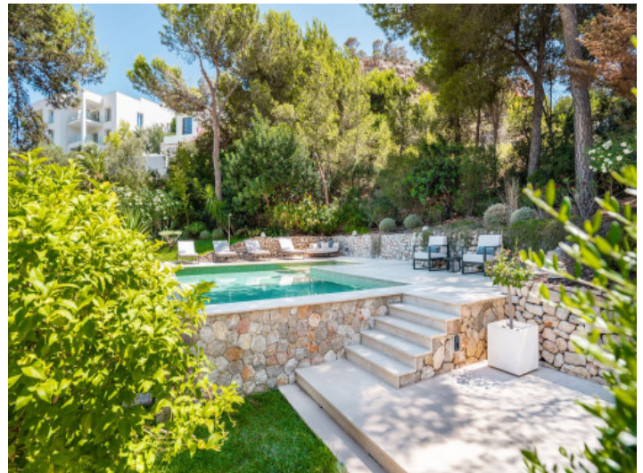
Enchanting outdoor area

All information is correct to the best of our knowledge. Errors and prior sale excepted. This prospectus is purely for information purposes. Only the notarized deed of sale is legally binding.