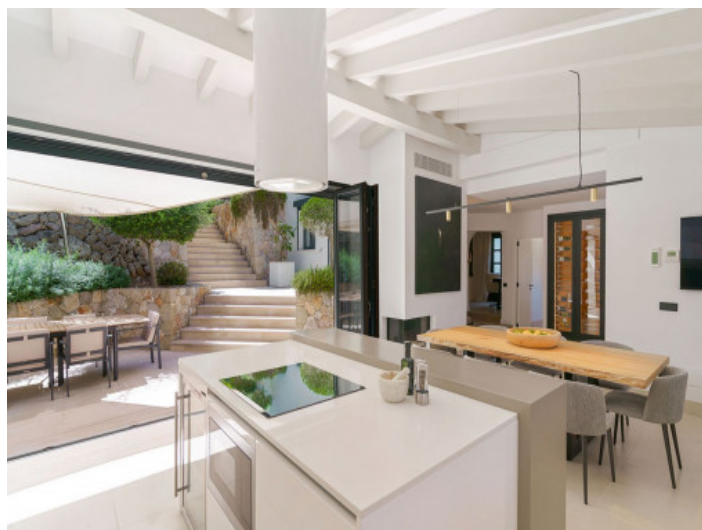
Modern, open kitchen

All information is correct to the best of our knowledge. Errors and prior sale excepted. This prospectus is purely for information purposes. Only the notarized deed of sale is legally binding.