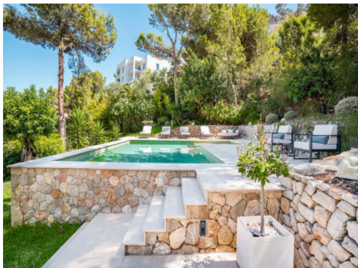
Wonderfully located pool