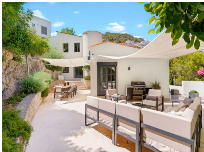
Mediterranean outdoor terraces