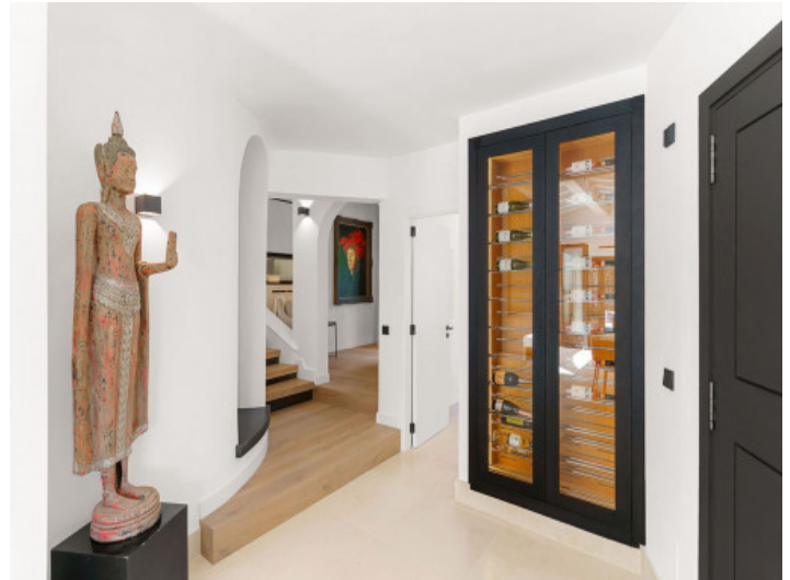
Corridor with wine cooler