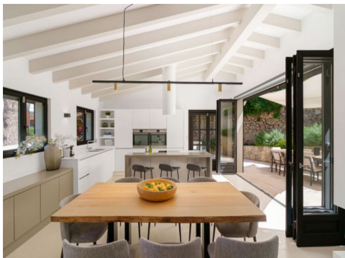
Wide access to the kitchen