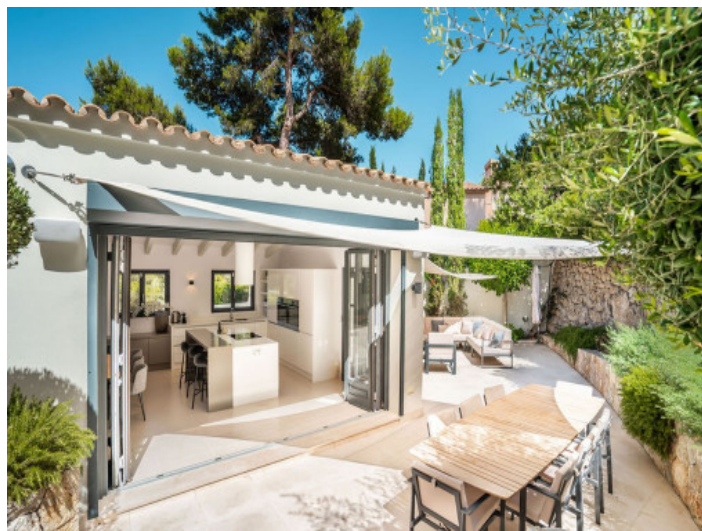
Beautiful outdoor dining area