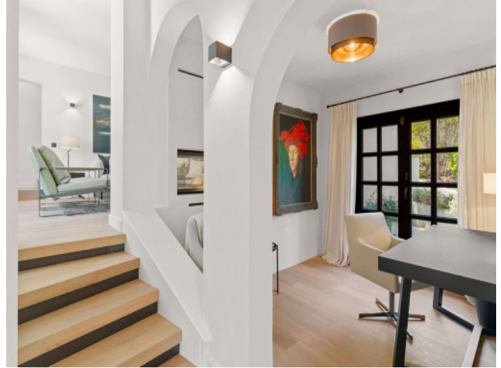
Half-open study room