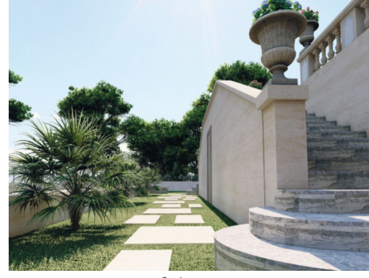
Garden with pool Garden area All information is correct to the best of our knowledge. Errors and prior sale excepted. This prospectus is purely for information purposes. Only the notarized deed of sale is legally binding.

PORTA MALLORQUINA • C./ CONQUISTADOR 8, 07001 PALMA TEL. +34 971 698 242 • INFO@PORTAMALLORQUINA.COM