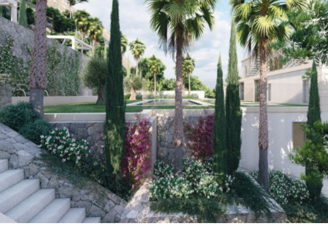
View of the garden