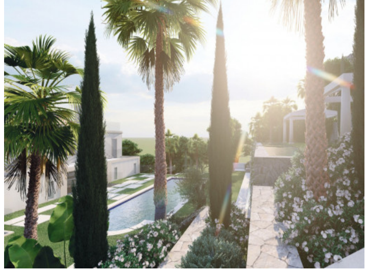
Mediterranean garden with pool

PORTA MALLORQUINA® Your home. Our passion.