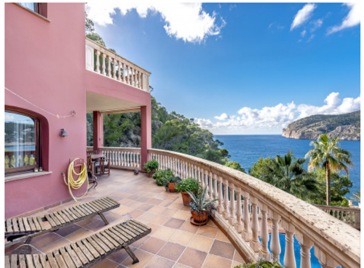
Terrace with sun loungers