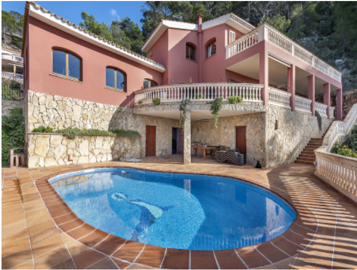
Exterior view of the villa property in Camp de Mar