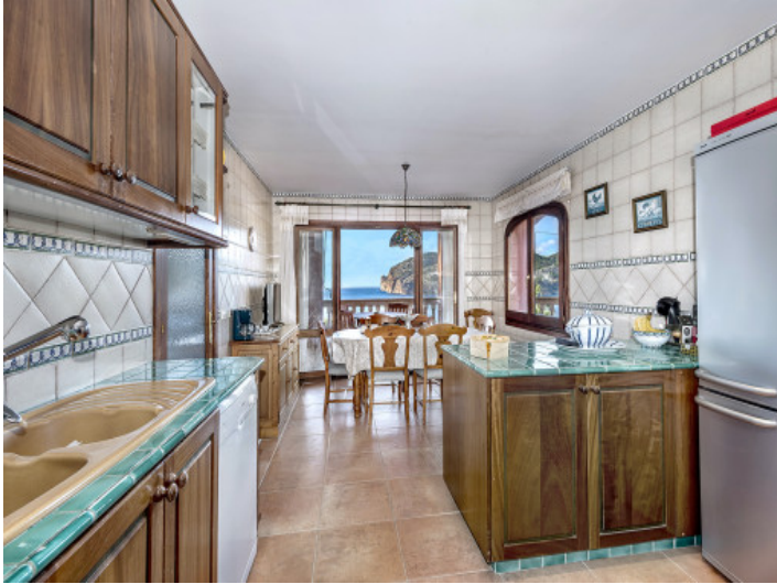
Rustic kitchen and dining area