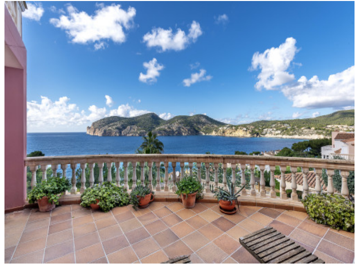
Views to the sea