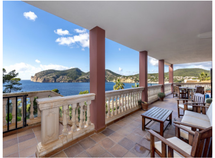
Balcony with a view