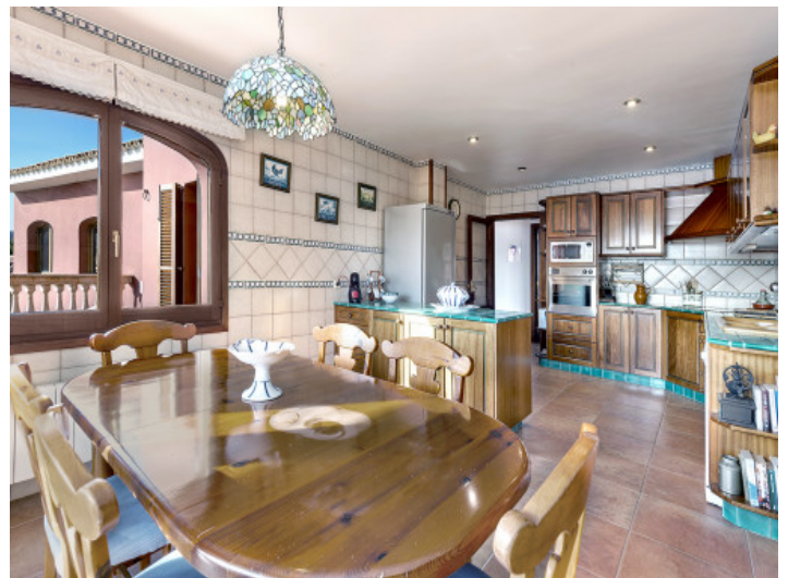
Rustic kitchen and dining area

All information is correct to the best of our knowledge. Errors and prior sale excepted. This prospectus is purely for information purposes. Only the notarized deed of sale is legally binding.