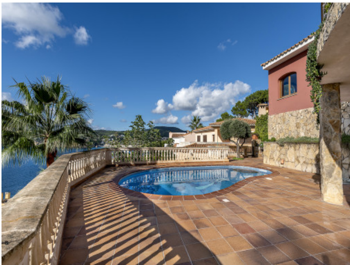
Sunny pool area and terrace