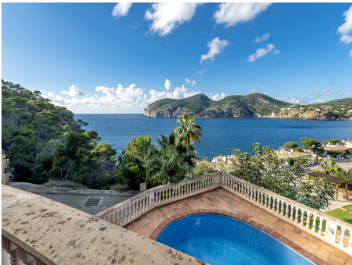
Splendid sea views of the villa in Camp de Mar