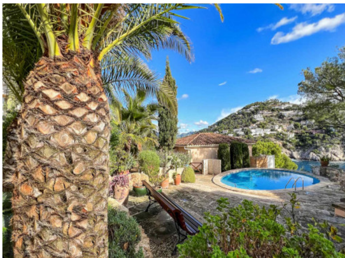
Mediterran garden with pool