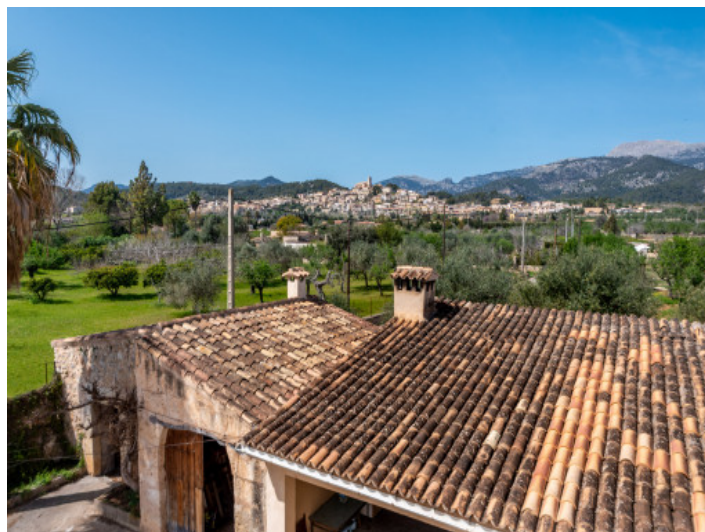
Views to the town