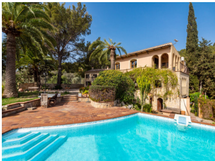
Beautiful pool in a very nice scenery