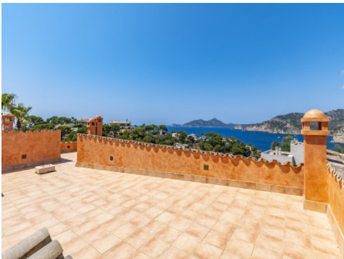
Sunny rooftop terrace