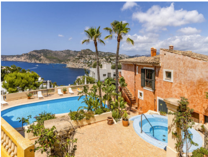
Inviting community pool area