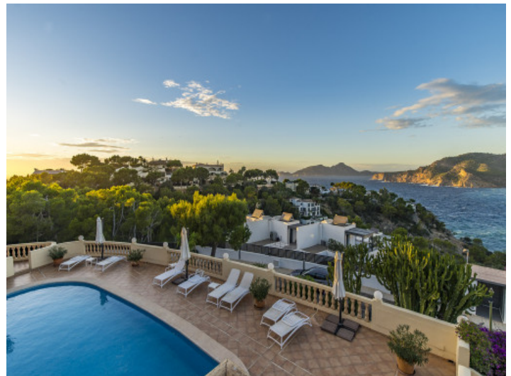
View over the pool