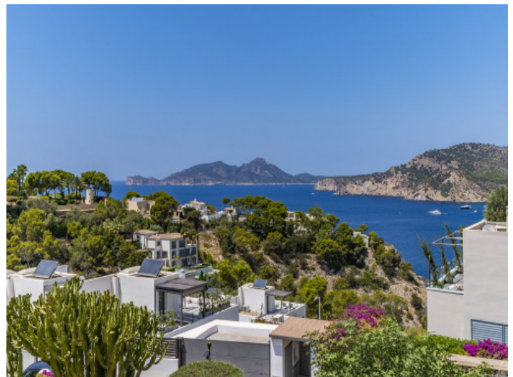
Splendid sea view

All information is correct to the best of our knowledge. Errors and prior sale excepted. This prospectus is purely for information purposes. Only the notarized deed of sale is legally binding.