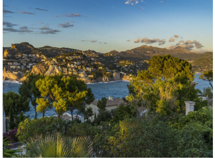
View to Port Andratx