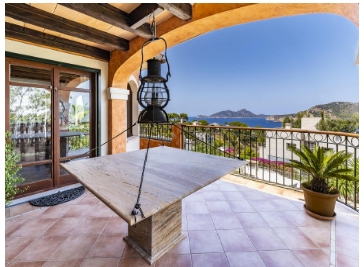
Balcony with dining area

All information is correct to the best of our knowledge. Errors and prior sale excepted. This prospectus is purely for information purposes. Only the notarized deed of sale is legally binding.