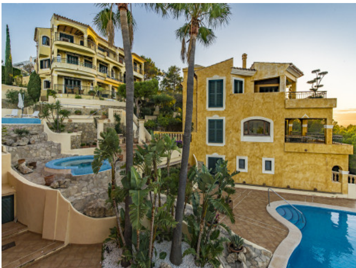
Complex and outdoor area