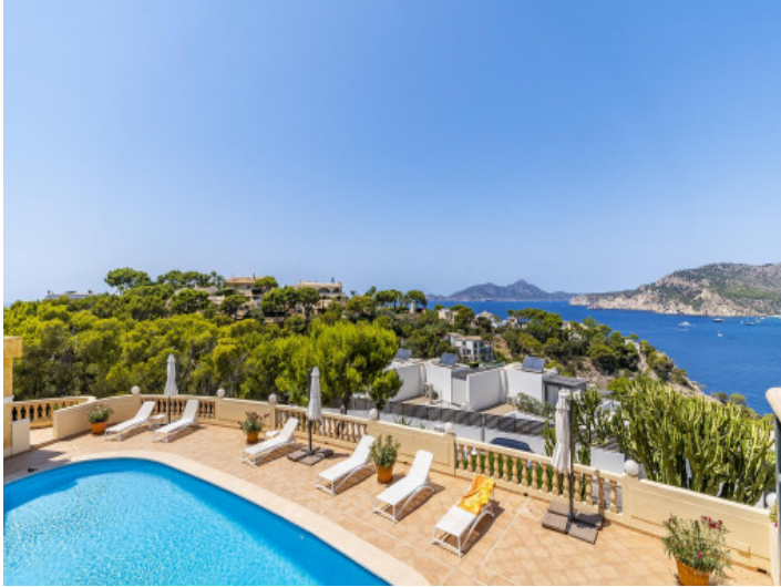
View over the pool and the sea