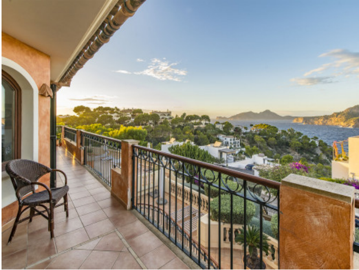
Wonderful sunset from the balcony