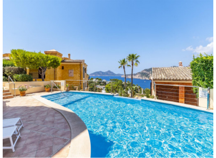
Pool with a view