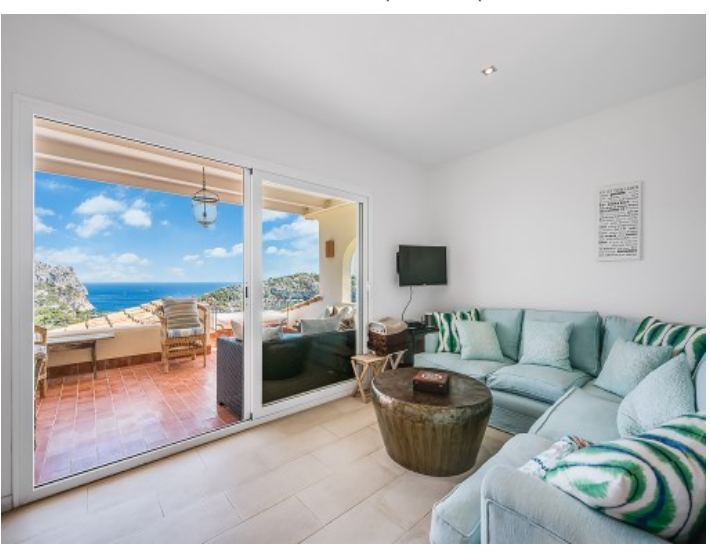
Living area with direct terrace access