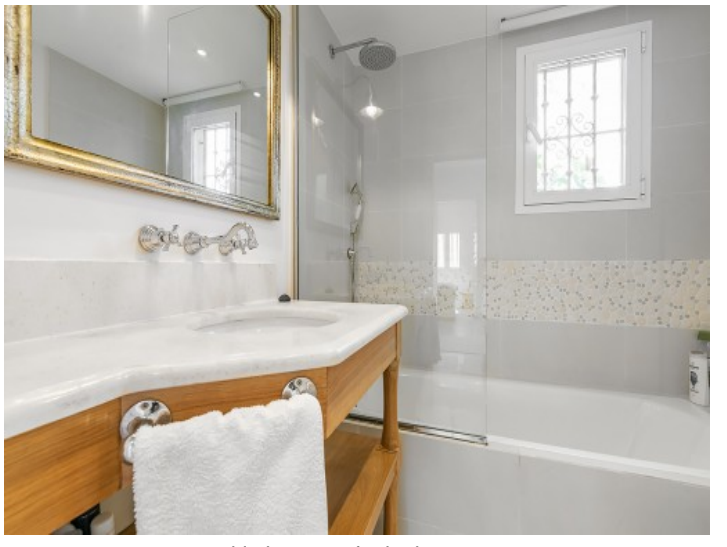
Modern en suite bathrooms