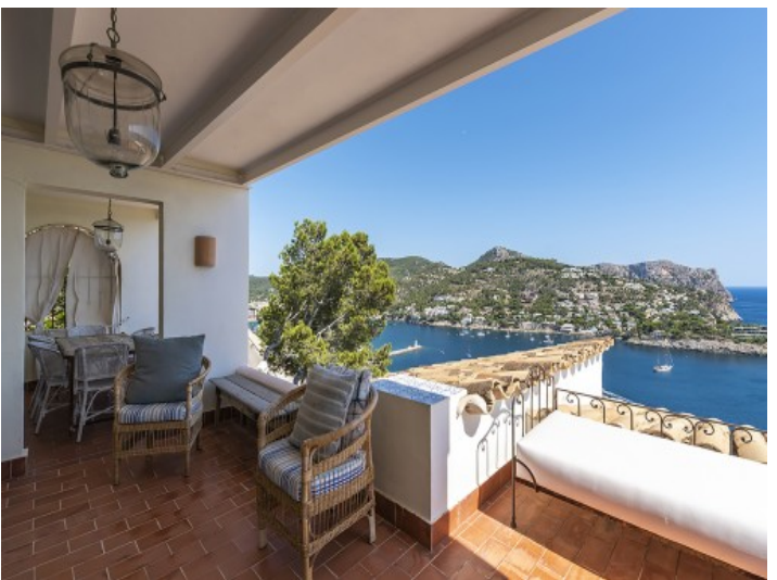
Terrace with various seating areas Communal pool in a unique location All information is correct to the best of our knowledge. Errors and prior sale excepted. This prospectus is purely for information purposes. Only the notarized deed of sale is legally binding.

PORTA MALLORQUINA • C./ CONQUISTADOR 8, 07001 PALMA TEL. +34 971 698 242 • INFO@PORTAMALLORQUINA.COM