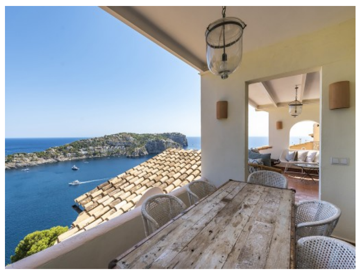
Dining area with fantastic sea views