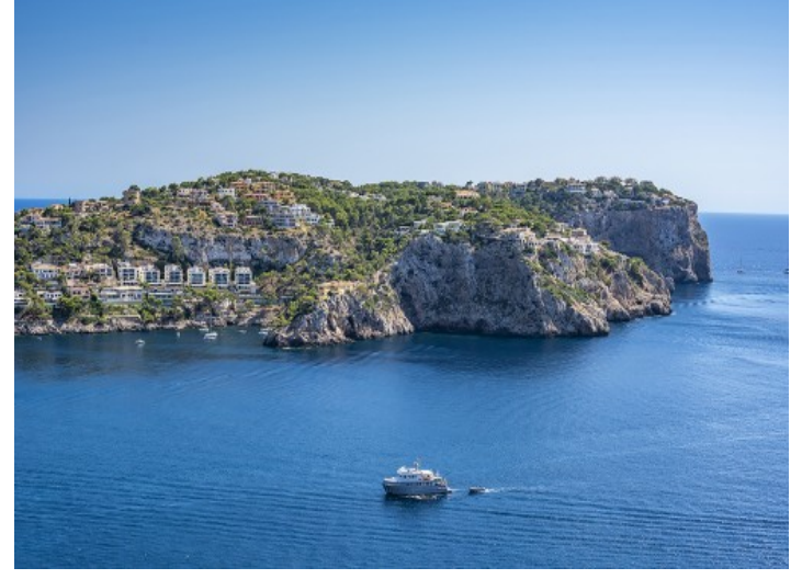
Breathtaking views of the open sea