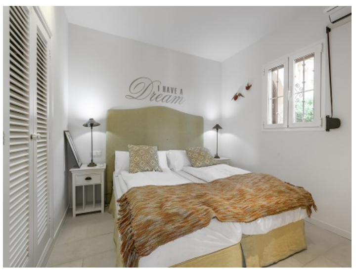
Second double bedroom