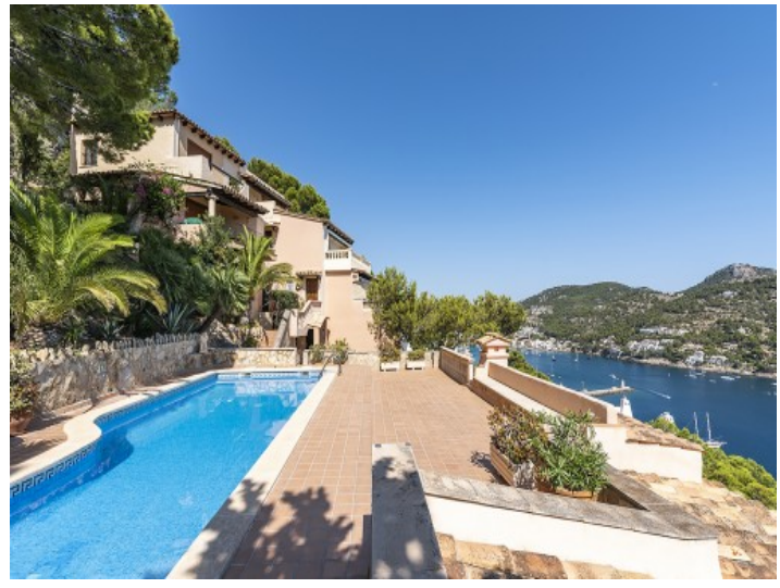
Well-maintained complex with pool