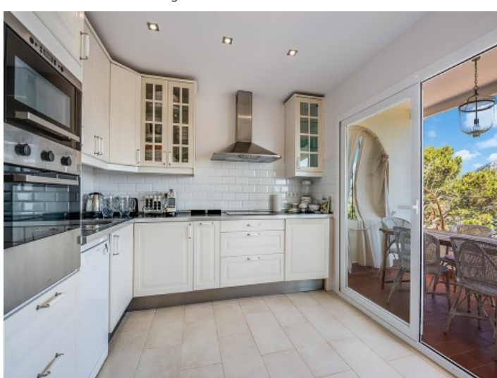
Modern, spacious kitchen Access to the outdoor dining area All information is correct to the best of our knowledge. Errors and prior sale excepted. This prospectus is purely for information purposes. Only the notarized deed of sale is legally binding.

PORTA MALLORQUINA • C./ CONQUISTADOR 8, 07001 PALMA TEL. +34 971 698 242 • INFO@PORTAMALLORQUINA.COM