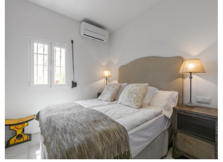
First double bedroom

PORTA MALLORQUINA® Your home. Our passion.