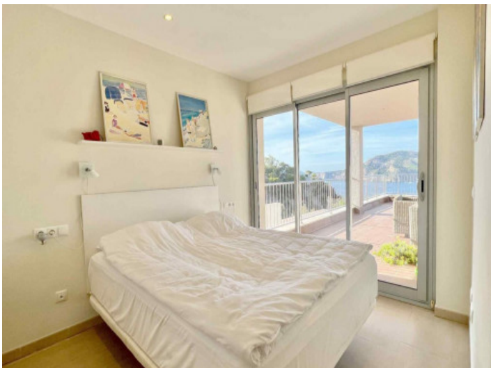
Bedroom with terrace access