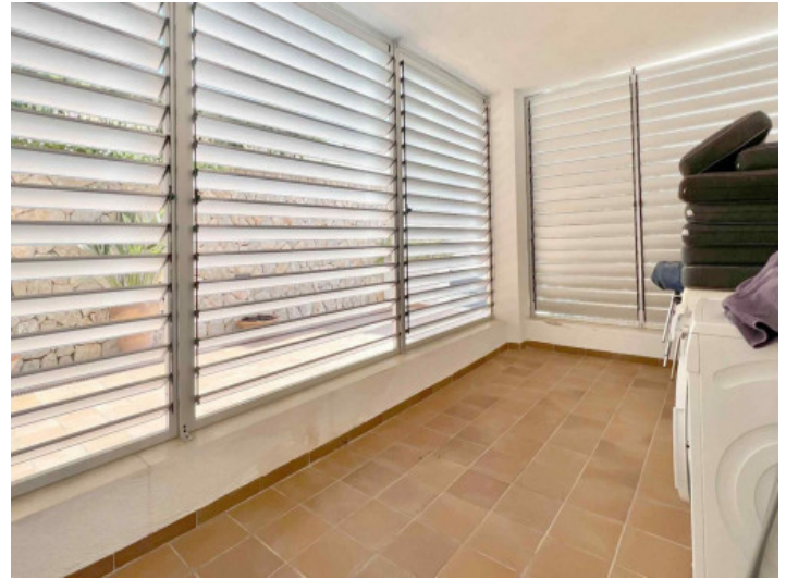
Storage room with washing machine