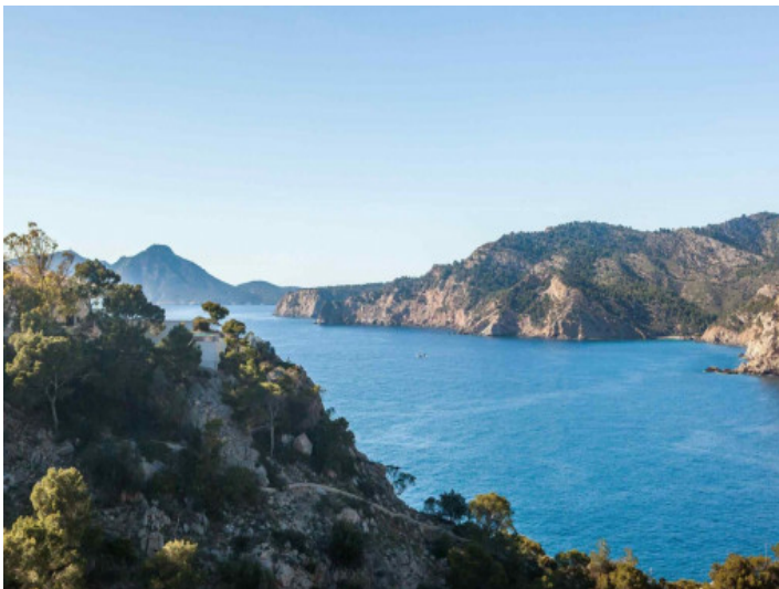
Unique sea views