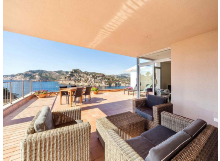
Lounge area on the terrace