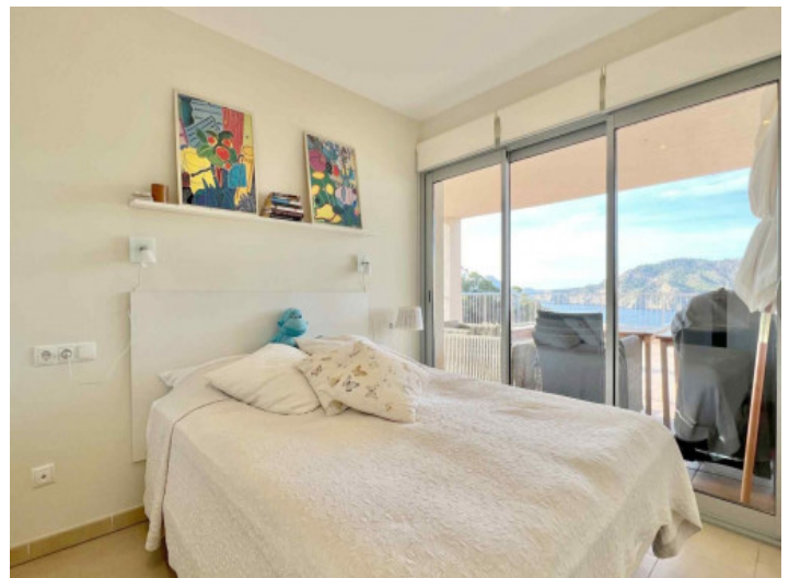
Bedroom with double bed

All information is correct to the best of our knowledge. Errors and prior sale excepted. This prospectus is purely for information purposes. Only the notarized deed of sale is legally binding.