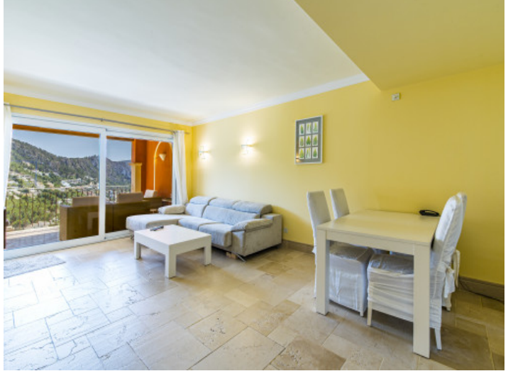
Lightflooded living area