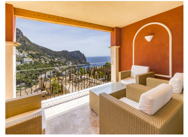
Wonderful sea view terrace

PORTA MALLORQUINA® Your home. Our passion.