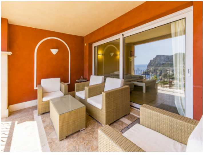
Terrace with lounge area