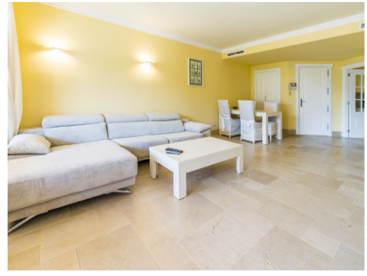
Spacious living and dining area